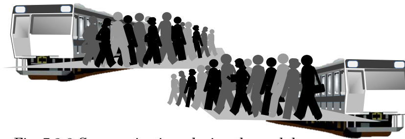
Fig. 7.2-2 Communications during the rush hour commute