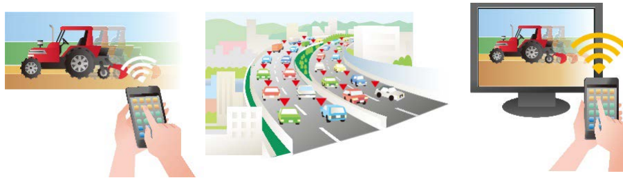
Fig. 7.2-3 Remote control of agricultural machines

In this section, the usage scenarios described provide novel methods to enhance conventional ones used in verticals, such as manufacturing and agriculture. They will create additional value, by improving productivity, create new business models and new customer values. Applications of sensor networks, big data analysis, and low latency feedback for prompt actuation will develop new uses for robots, drones, instruments and machinery.