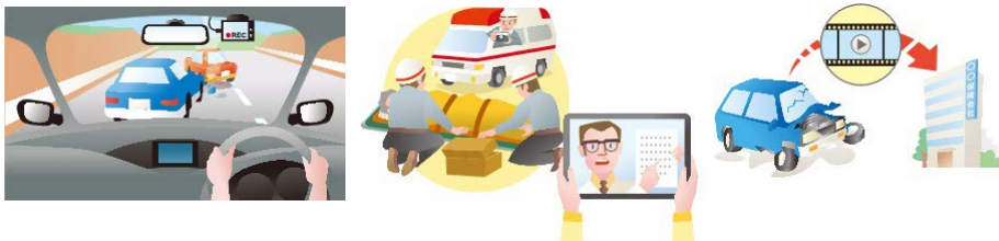
Fig. 7.2-4 Enhanced Emergency call

In this section, the usage scenarios that provide countermeasures against emergency situations such as traffic accidents and sudden illnesses, or disaster situations caused by earthquakes, floods, fires and typhoons. These countermeasures are intended to