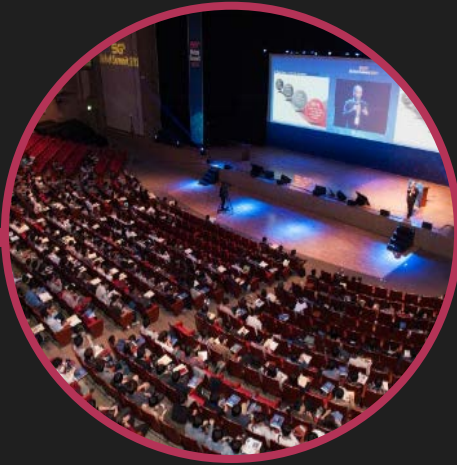
Global Conference - Day1~2 -