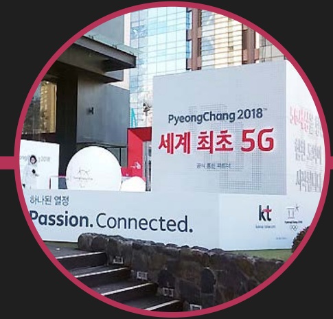
5G Tour at Pyeonchang (Olympic Venue, invited only) - Day3 -