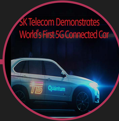
5G Tour in Seoul (Visiting operators' 5G trial region ) - Day2 -